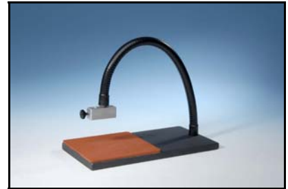
Lightguide Mounting Stand (fits 3 mm, 5 mm and 8 mm lightguides) PN 39700