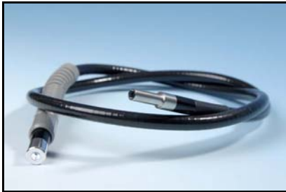
Liquid Lightguides available in 1, 2, 3 and 4-pole configurations (see Table 1 on page 3 for sizes and part numbers)