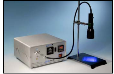
Rod Lenses Shown: BlueWave 75 with 8 mm rod lens (rod lenses require an 8 mm lightguide) 50 mm x 50 mm Area (~100 mW/cm 2 ) PN 38699 127 mm x 127 mm Area (~30 mW/cm 2 ) PN 38698