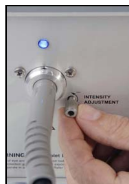
Intensity adjustment knob for fingertip adjustment