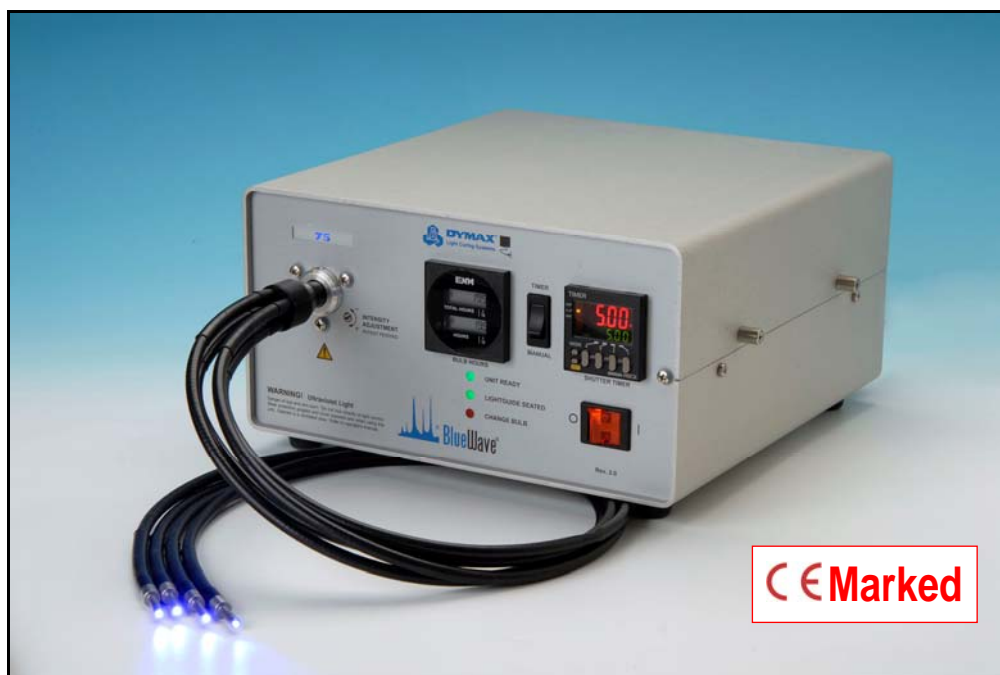
BlueWave 75 UV-Curing Spot Lamp with Intensity Adjustment and Four-Pole Lightguide

The BlueWave 75 spot lamp emits UVA and blue visible light (300-450 nm) and is designed for curing of UV and visible curable adhesives, coatings and encapsulants. It contains an integral shutter which can be actuated by a foot pedal or PLC making it ideal for both manual and automated processes. An auto-ranging power supply provides consistent performance at any input voltage (90-264V, 47-63 Hz). DYMAX also offers a wide range of long-lasting liquid and fiber lightguides in single, multi-legged, and various length configurations. The BlueWave 75 with intensity adjustment is the most versatile, user-friendly, and reliable spot cure unit available.