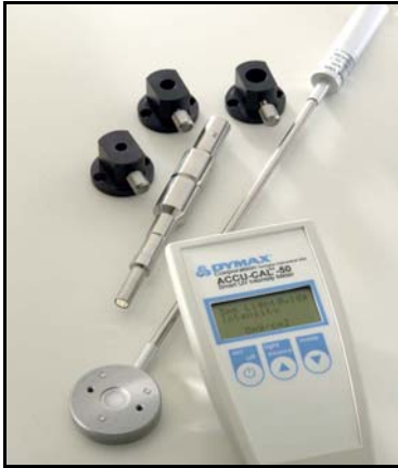
ACCU-CAL™ 50 Radiometer for measuring the UV intensity of spot lamps, flood lamps, and conveyor systems PN 39560