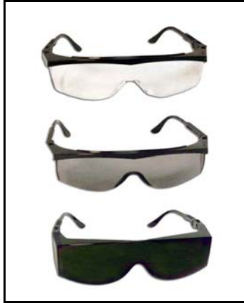
UV Protective Safety Goggles Grey PN 35285 Green PN 9162044