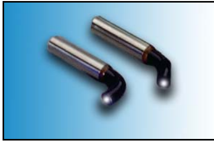
Angled Terminators for Lightguides 3 mm/60° PN 39029 □ 3 mm/90° PN 39030 5 mm/60° PN 38042 □ 5 mm/90° PN 38049