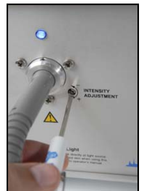
Intensity adjustment, with knob removed, performed with adjustment tool