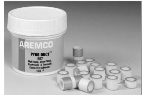
Pyro-Duct™ 597-C metallizes ceramic tubes.