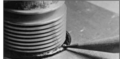
Aremco-Bond™ 805 bonds aluminum heat sink to a power semiconductor device.