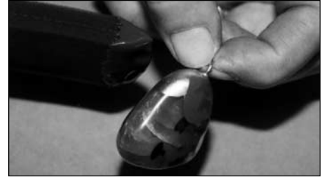
Pyro-Duct™ 598-C metallizes handbag accessory for plating.